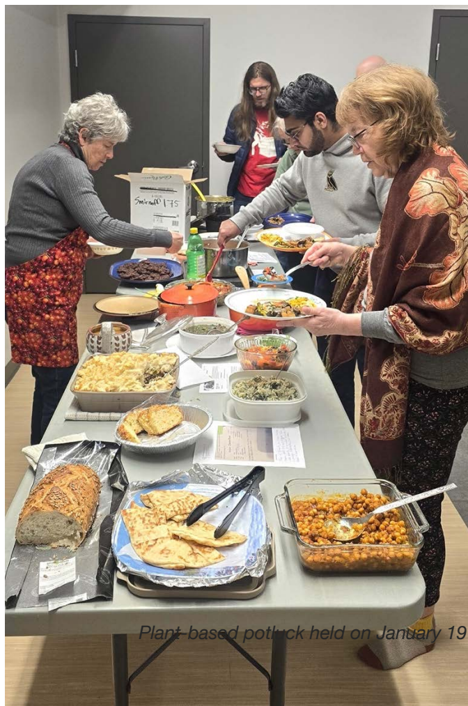
Plant-based potluck held on January 19