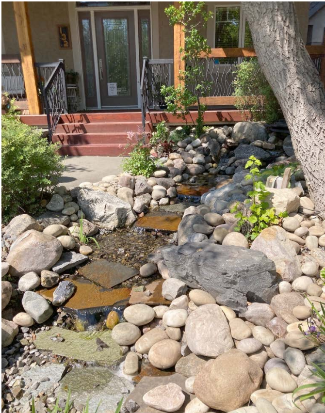
More accomplished open gardeners who participated in the event.