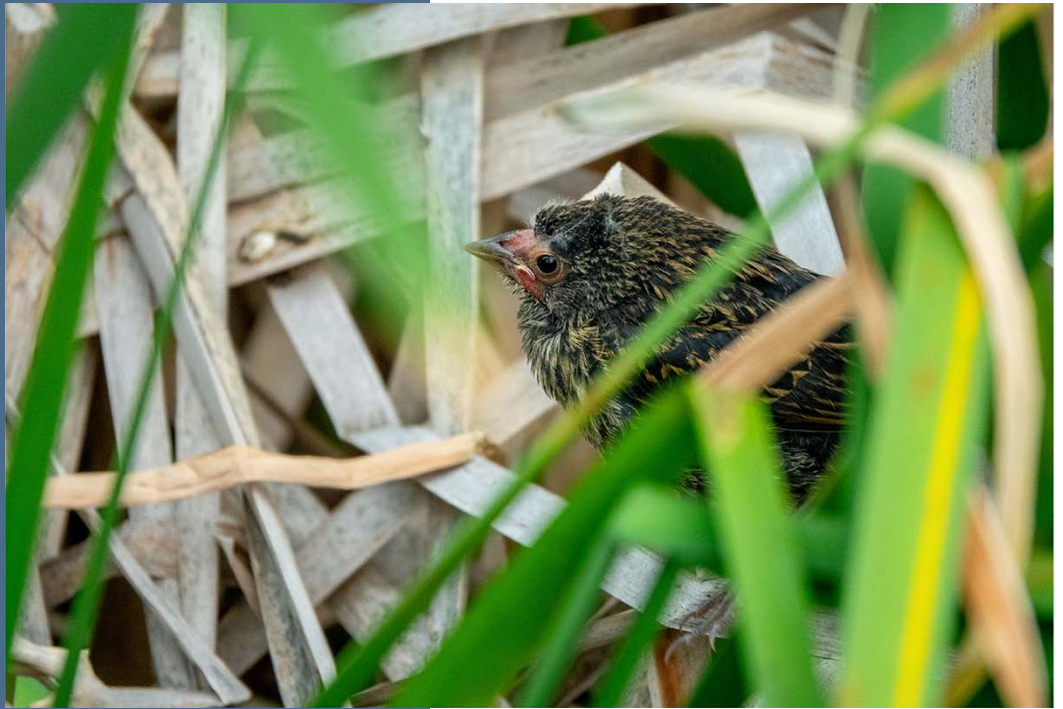
Junior waiting impatiently in its nest (at John Janzen Nature Centre).