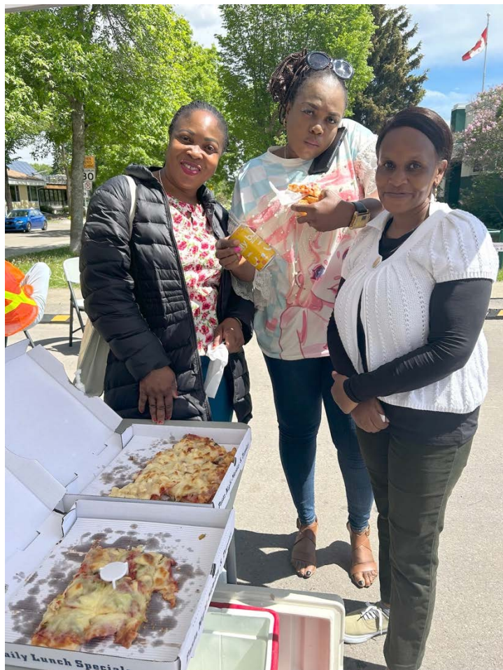
St. Paul's United Church sponsored refugees