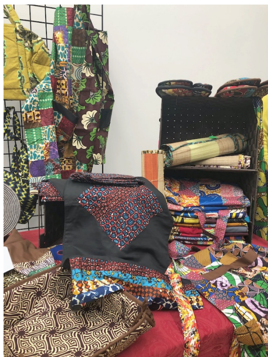
A teaser of the locally made gifts you'll find at the 2023 Belgravia Holiday Market