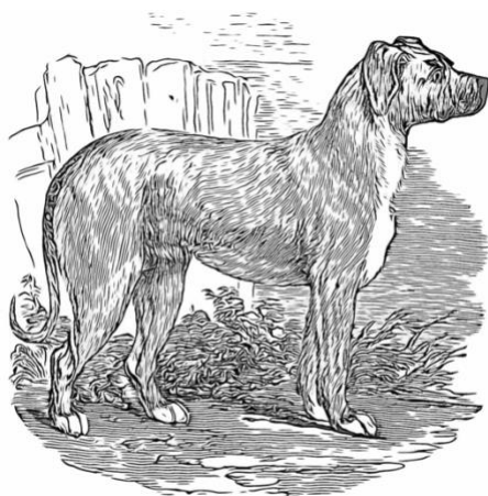
THE CUBA BLOODHOUND.

Next steps: In receiving these recommendations, the BCL Board decided to form a working group to further consider options and develop an implementation plan.