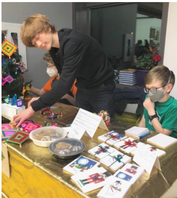
Market attendees shopping local, and young Belgravians selling their amazing wares