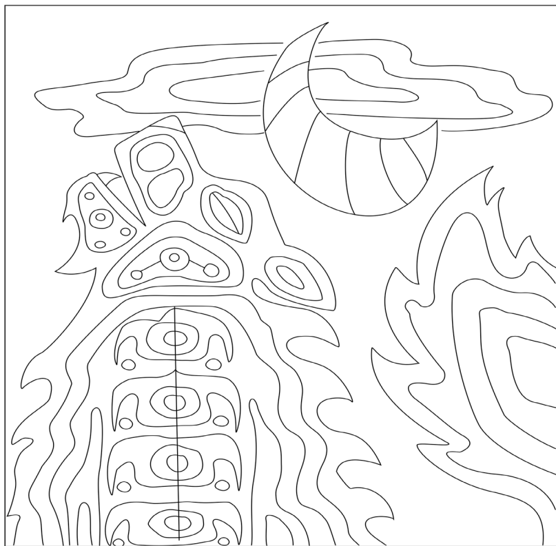
Mahihkan | Wolf | Loup

NATIONAL ARTS CENTRE CENTRE NATIONAL DES ARTS Canada is our stage. Le Canada en scène.