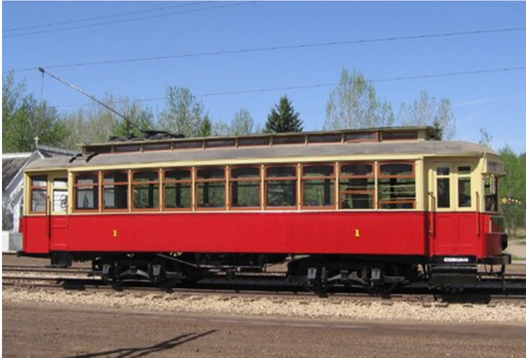
Streetcar #1, www.edmonton-radial-railway.ab.ca

On November 9, 1913, the rail line out to McKernan Lake was completed and service was initiated (Hatcher and Schwarzkopf, 1983). The route of Streetcar No. 1 ran along Whyte Avenue (82nd Avenue), turning south on Main Street (104th), and then proceeding west on a single track along 76th Avenue past McKernan Lake until 116th Street. “One week later, large crowds went skating to McKernan’s Lake, arriving via the “red” car line across the Low Level bridge, the special High Level Bridge cars to the Lake or the regular High Level Bridge cars to 109 Street and Whyte Avenue and walking to the Lake” (Hatcher and Schwarzkopf, 1983).