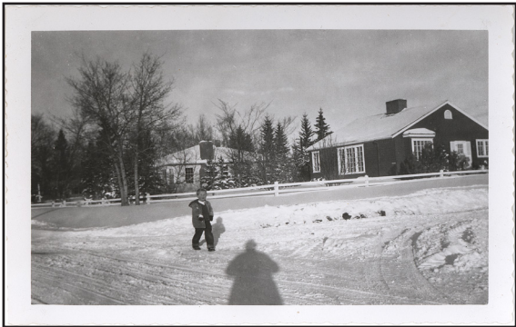
(Left) 1967 University Farm Campus aerial The farm had originally been on the U of A campus, then moved south. At one time, cows grazed where Belgravia is now! This photo is from July 1967, when the farm was mostly where it is now. Belgravia and the U of A are visible to the north. (Below) Aerial view of Belgravia Image taken in fall of 1976 at 6300m altitude. Note the 114 Street traffic circles.