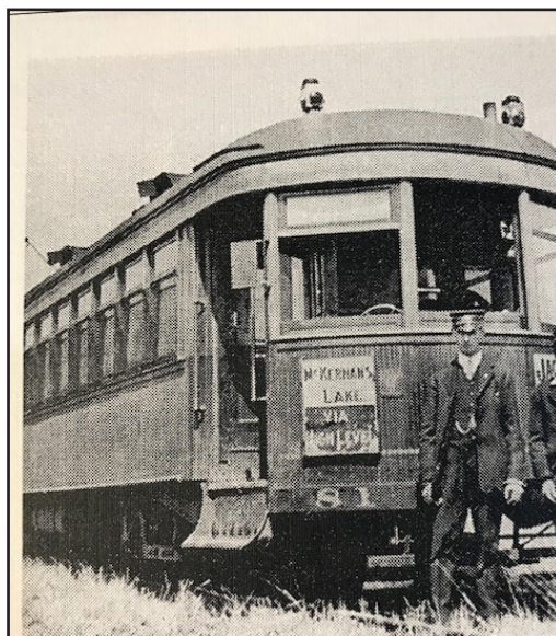
McKernan Lake Line (Toonerville Trolley), c.1916