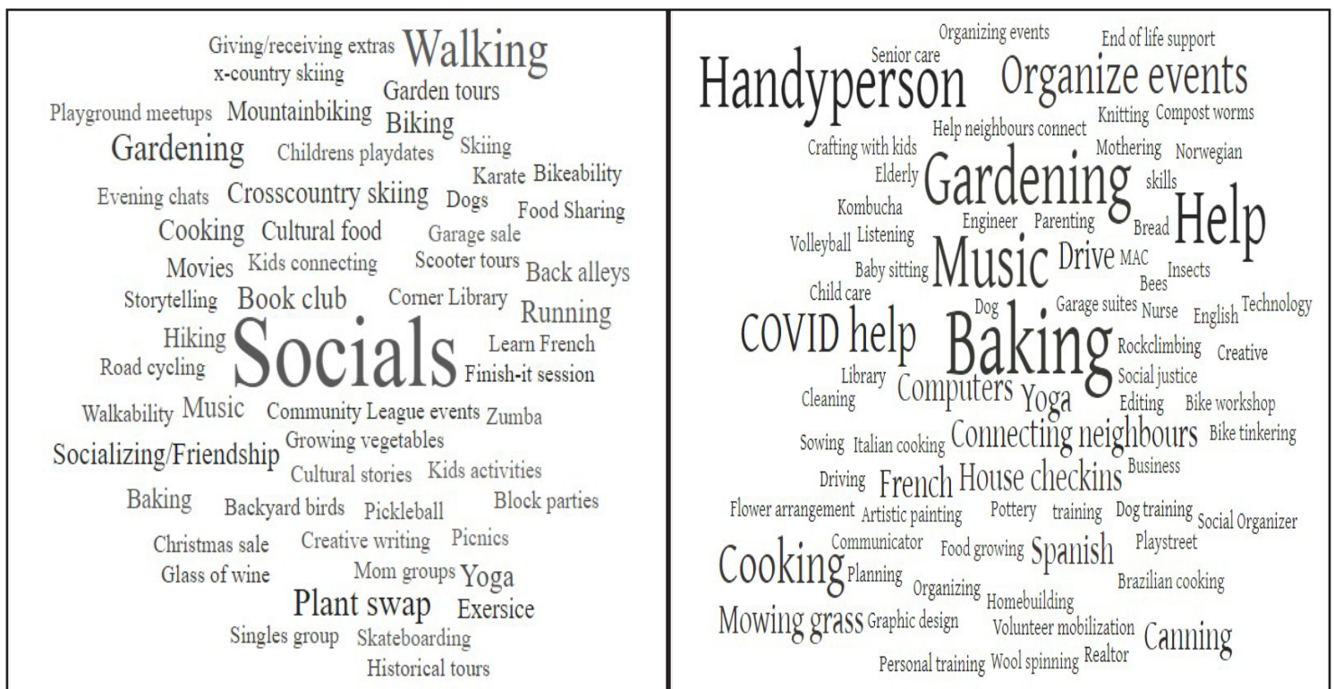
Skills, abilities, and passions of some Belgravians

The larger the font, the more people have the skill/interest. Word clouds created with woritout.com