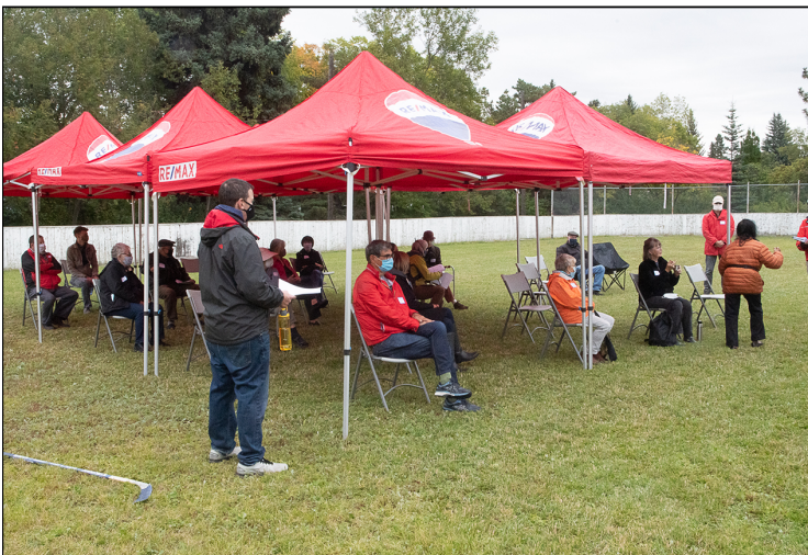
Start of Belgravia's AGM