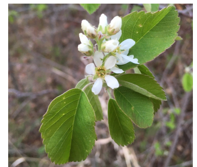
Saskatoon flowers - photo taken May 17

On May 21, along Saskatchewan drive near the university of Alberta, the trees were well leafed. The saskatoons ( Amelanchier alnifolia ), and pin cherries ( Prunus pensylvanica ) were both around 50 to 70% of flower buds open. The pin cherries started a bit earlier, but then the saskatoon bushes leapt quickly into bloom. Very soon the common purple lilac ( Syringa vulgaris ) and chokecherries ( Prunus virginiana ) will also flower. If observing and reporting bloom times sounds like fun, do check out my PlantWatch page ( http://plantwatch.naturealberta.ca/ ) for information on over 20 wild plants, plus a few non native plants (dandelions and lilac). There are exciting stories here. Did you know that saskatoon was the most important plant food for the Blackfoot first nation? And that bunchberry is the fastest plant on earth? The federal PlantWatch program has info on more plants from across Canada as well: https://www.naturewatch.ca/plantwatch/ .