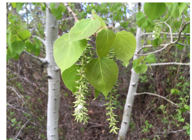
Female aspen catkins - photo taken May 17

On May 21, along Saskatchewan drive near the university of Alberta, the trees were well leafed. The saskatoons ( Amelanchier alnifolia ), and pin cherries ( Prunus pensylvanica ) were both around 50 to 70% of flower buds open. The pin cherries started a bit earlier, but then the saskatoon bushes leapt quickly into bloom. Very soon the common purple lilac ( Syringa vulgaris ) and chokecherries ( Prunus virginiana ) will also flower. If observing and reporting bloom times sounds like fun, do check out my PlantWatch page ( http://plantwatch.naturealberta.ca/ ) for information on over 20 wild plants, plus a few non native plants (dandelions and lilac). There are exciting stories here. Did you know that saskatoon was the most important plant food for the Blackfoot first nation? And that bunchberry is the fastest plant on earth? The federal PlantWatch program has info on more plants from across Canada as well: https://www.naturewatch.ca/plantwatch/ .