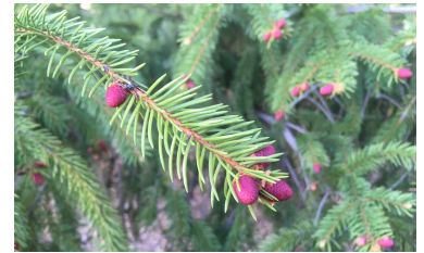
Red male cones before pollen shed - photo taken May 18, Windsor park school

The non-native trees here in the city, such as Manitoba maple, Colorado blue spruce, Mayday trees (from Siberia), American and Siberian elm, etc. do well here. Did you know the most similar climate to Edmonton is the central plain of Siberia? No wonder those trees are happy here. But the recent dry years (most of the last 22 years starting with the big El Nino of 1998) have been hard on native birch, balsam poplar and white spruce.