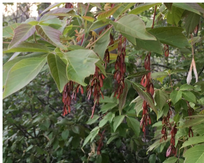
Manitoba maple keys (seeds)

The native Alberta trees we do have: including aspen, balsam poplar, white birch, white spruce are well adapted to Edmonton's dry climate. They really need our summer 'monsoon' rainy season to do well here. Soon the aspen female trees will shed fluffy white seeds from capsules on their dangly catkins.