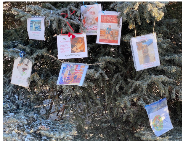
Lovely messages are shared by our human and canine friends.