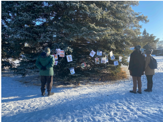
Dog park visitors admire the home-made cards on the Christmas card tree!

If you are not familiar with the tree, have a look out for it next year. It is just a few steps to the north along the path from the open area of the off-leash. Feel free to hang a card of your own!