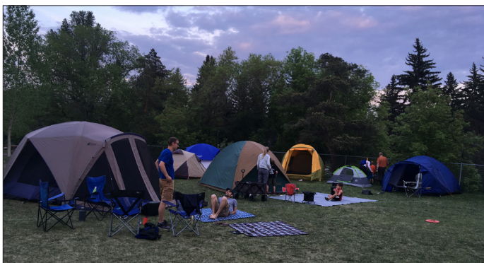
Grade 1 campout