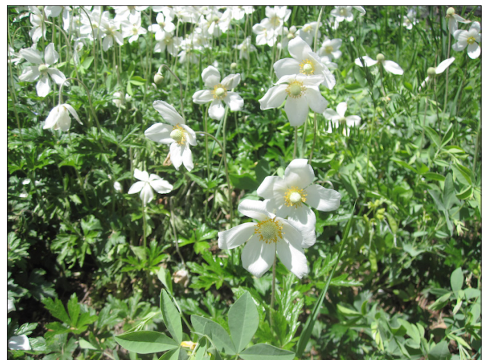
Prairie flowers in Arts Park

We are also looking at many other possible changes to reduce our environmental impact including recycling programs, using paper straws and recycled paper products, bring your own dish to events etc... Do you have any ideas? We would love to hear from you! Please email communications@belgraviaedmonton.ca