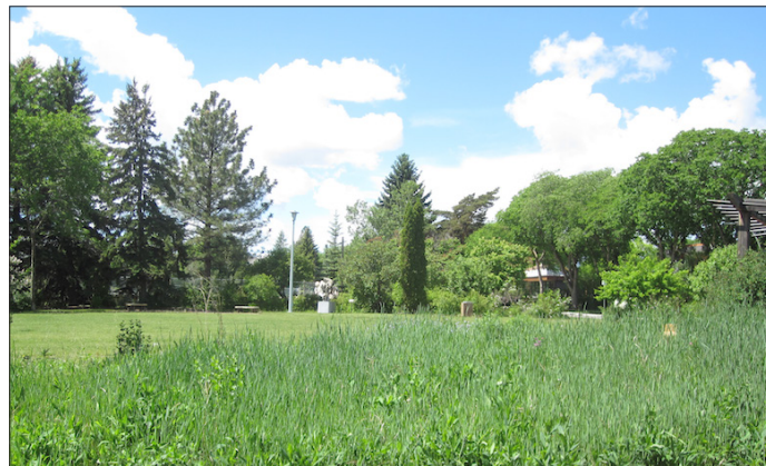
Prairie grasses and Arts Park