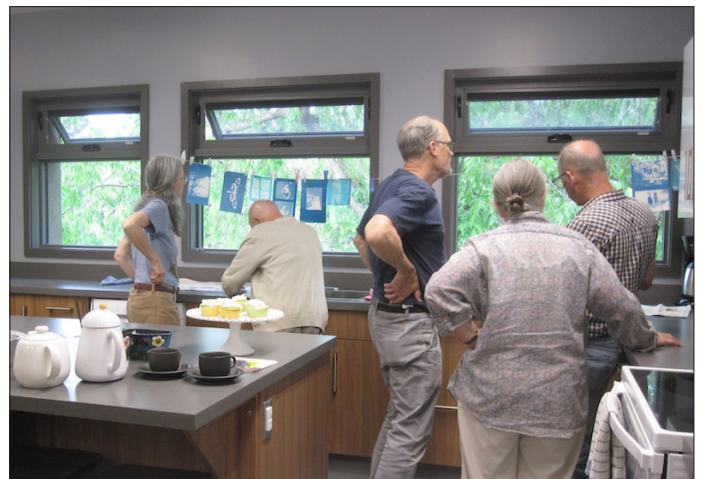
Discussing cyanotypes over tea and cake.