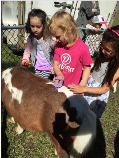
Grade 1 girls at a pop up school petting zoo