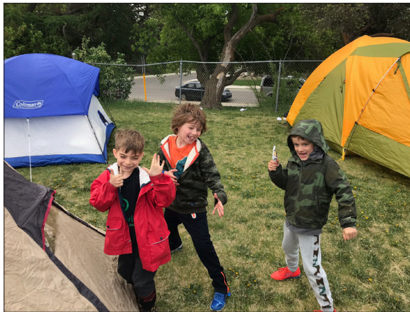
Grade 1 boys at the school camp out