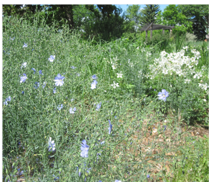
Prairie flowers in Arts Park

Banner photo: Made in Belgravia: Cyanotype photographs hanging to dry