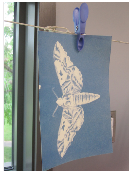
Cyanotype photograph of an insect.