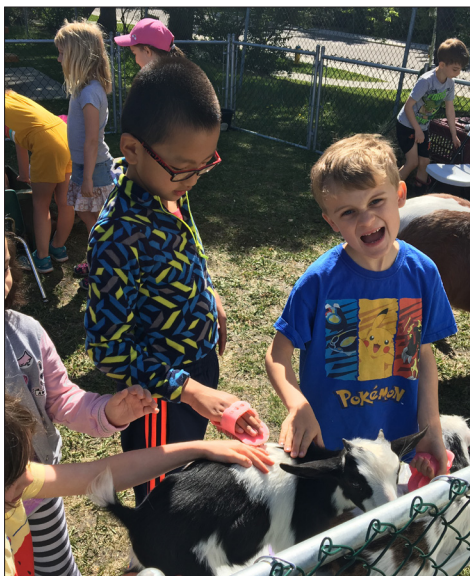
Grade 1 students at the petting zoo