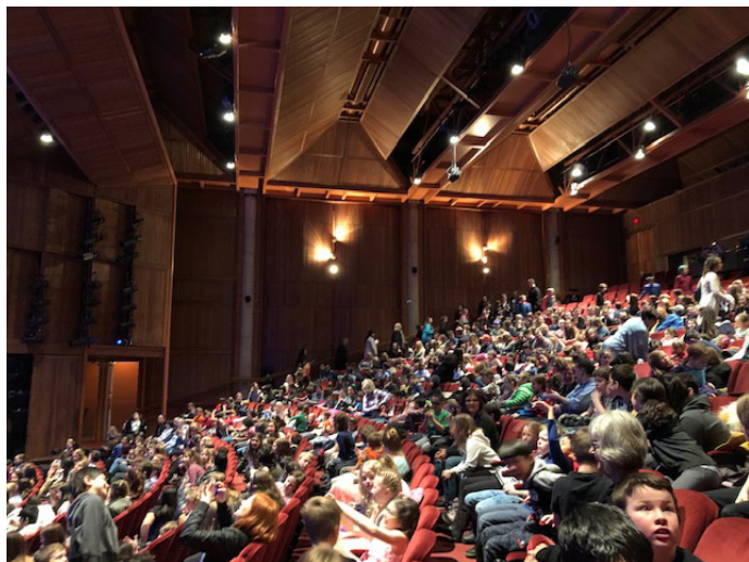
Grades 1–6 students watching Matilda The Musical at the Citadel Theatre.

Belgravia students and staff had an exciting month with lots of in and out-of-school field-trips, including making glass art, a Ukrainian Shumka Dancers performance at the Jubilee, skating, and more. Here are photos from some of those activities.