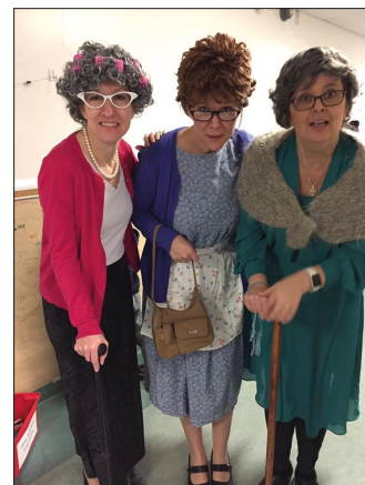
School staff dress up to celebrate the 100th day of school.