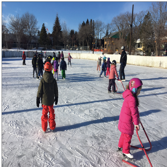
The Grade 1 class enjoys an outdoor field trip at the community skating rink.