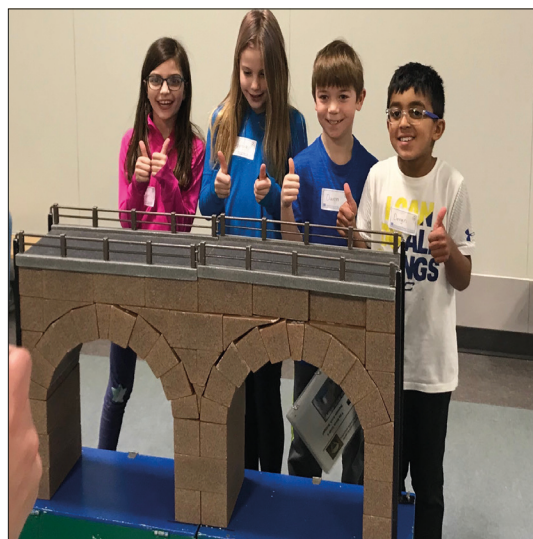
Grade 3 students take an in-depth look at building bridges during an in-school field trip.