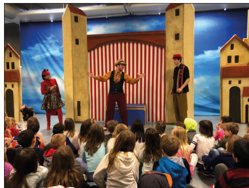
Alberta Opera's performance of Pinocchio, held at Belgravia School on February 13th