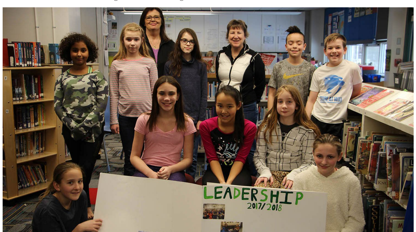
Grade 6 Leadership Team Members

All the students on the team agreed that it feels good