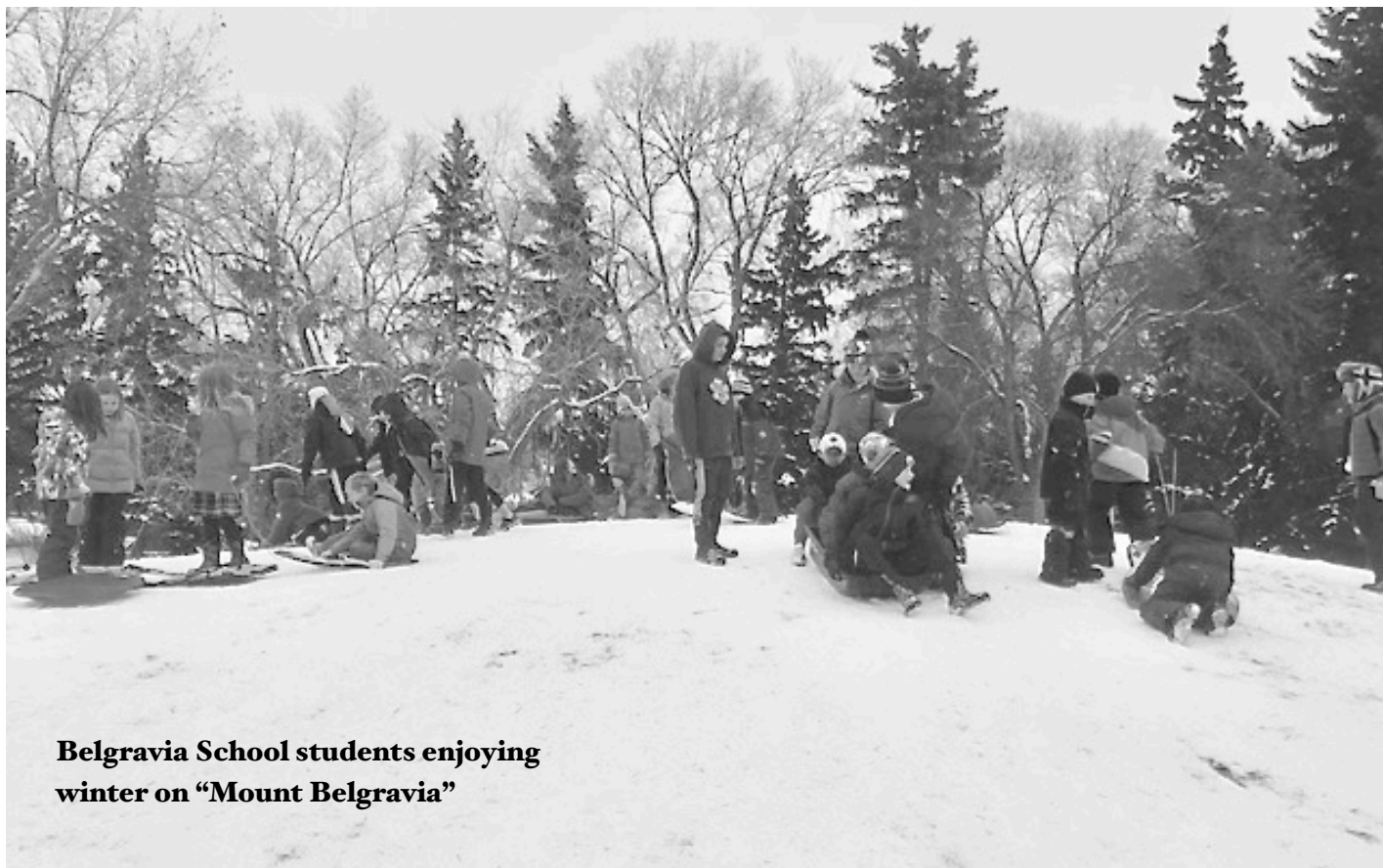
Belgravia School students enjoying winter on “Mount Belgravia”