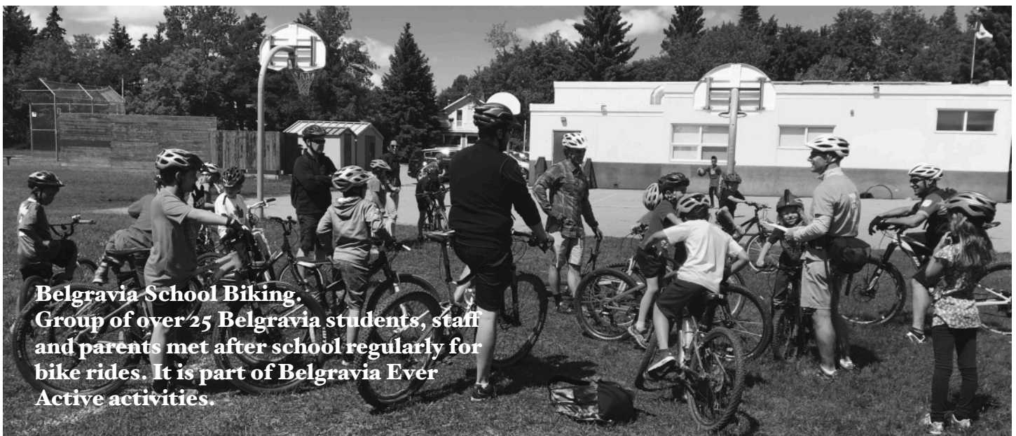
Belgravia School Biking. Group of over 25 Belgravia students, staff and parents met after school regularly for bike rides. It is part of Belgravia Ever Active activities.

Information about the Belgravia Square Development is available on the Belgravia Community Website: http://belgraviaedmonton.ca/major-development-proposal-for-review/