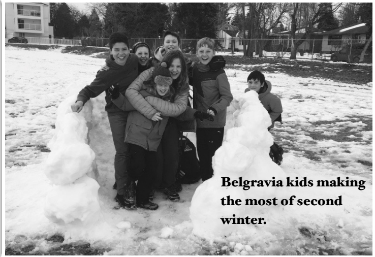
Belgravia kids making the most of second winter.

LOCATED ONE BLOCK EAST OF McKERNAN SCHOOL