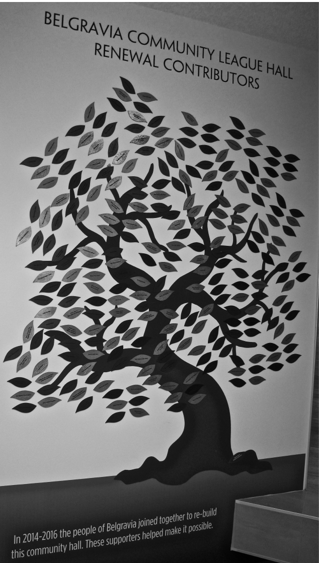
Wei Yew's wonderful Contributor Recognition Design in the new community hall