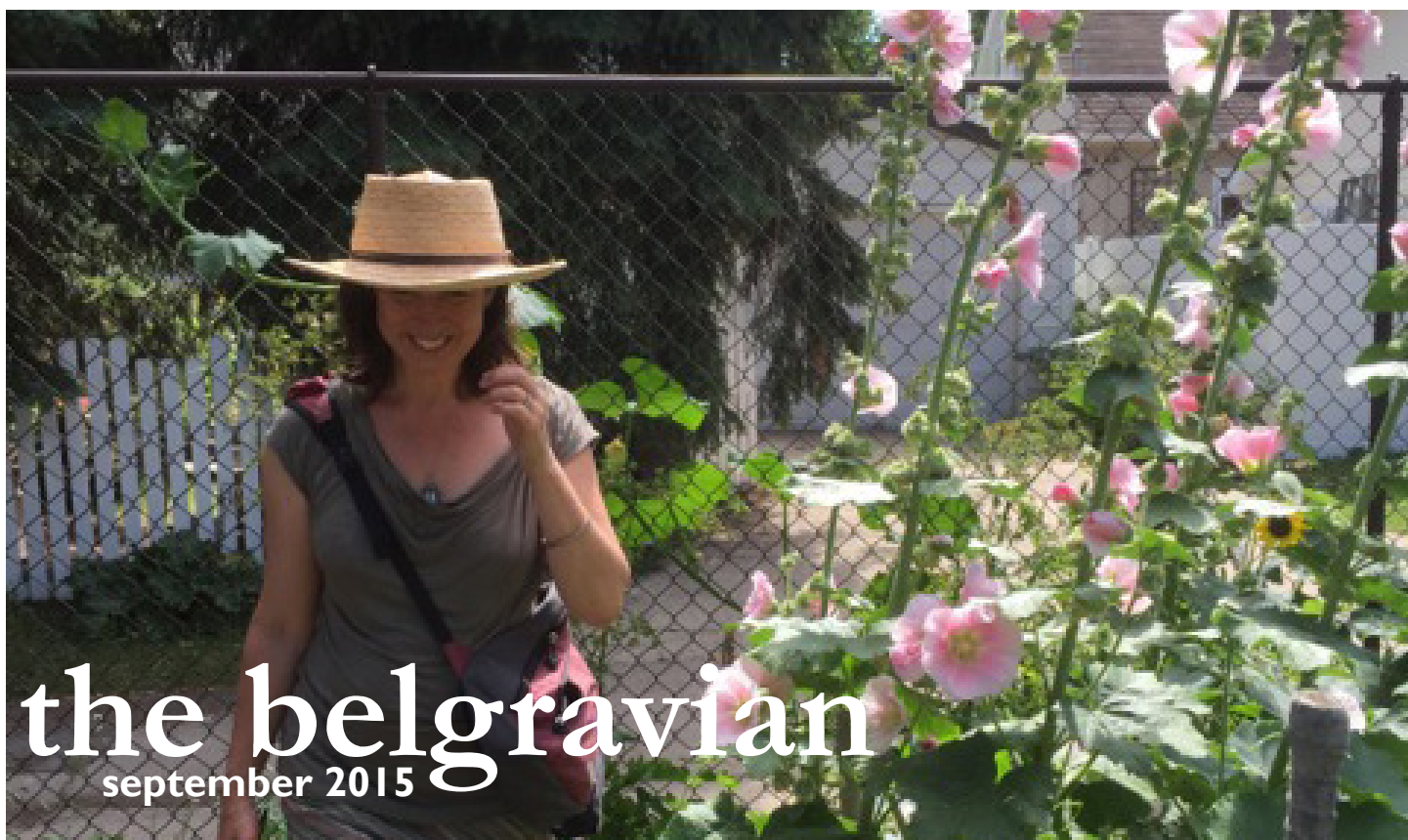
Taken at the Belgravia Edible Gardens Tour on August 9.