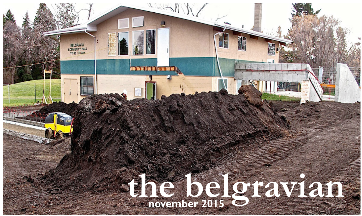
Our Hall Renewal Committee has launched a second fundraising campaign to raise an additional $68,000 by December. See pages 4-5.