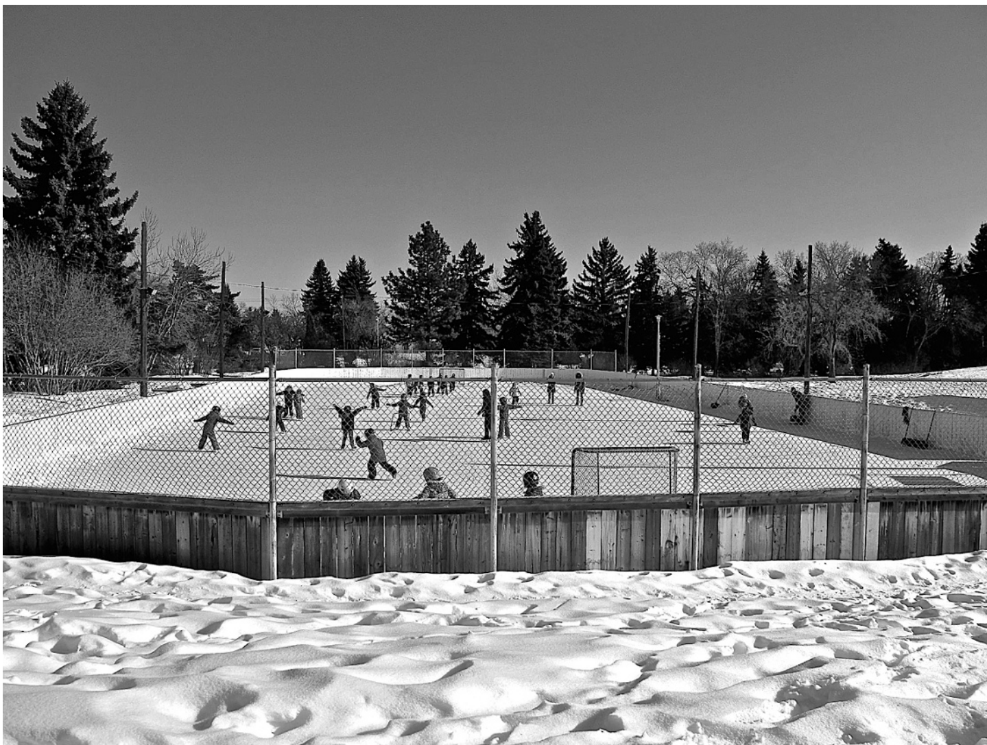
Enjoying the Belgravia ice rink, Winter 2014