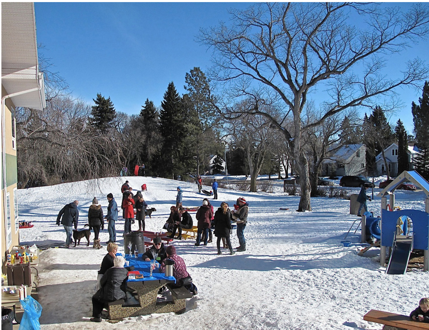
Family Day 2014 Belgravia Style!