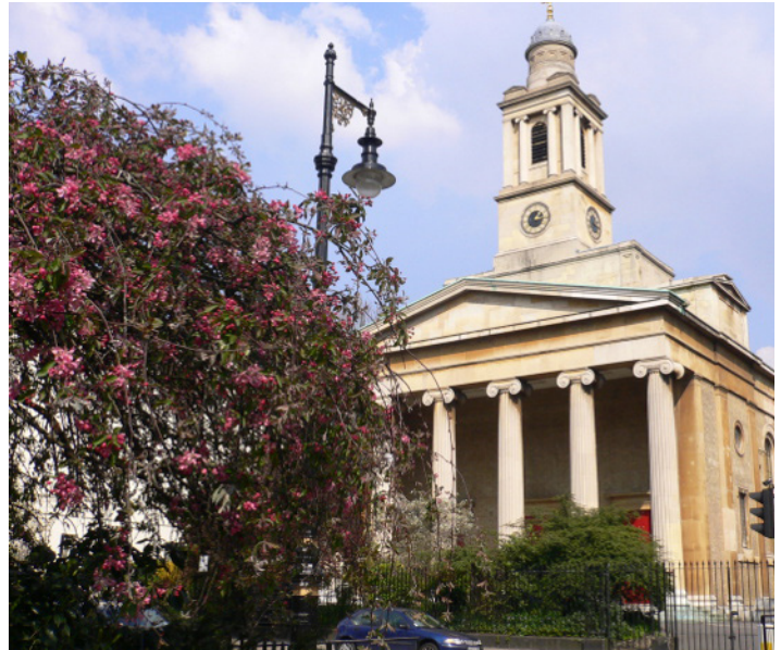
Architecture in historic Belgravia in Central London, UK