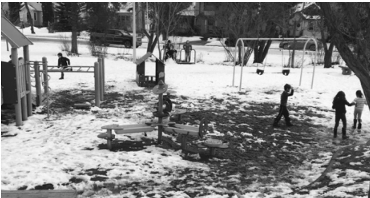
Belgravia School students enjoying the playground.

Here is the link to the C4RD website: http://c4rd.ca/